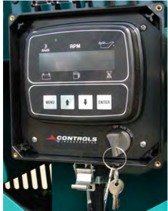
State of the art Control Systems