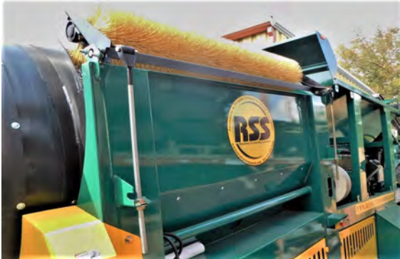
Ground level brush adjustment

5' x 8' "Quick change" drum, reversible; 4 wheel drive, variable speed, one piece screen; 4 1/2 Cu. yd. hopper - 36" variable speed feeder; Low dump height - load by skid steer or backhoe; 36" End discharge conveyor, 70 yd. stockpile;